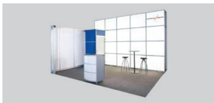
Complete rental stand HELIOS

Please contact me – contact data see above.