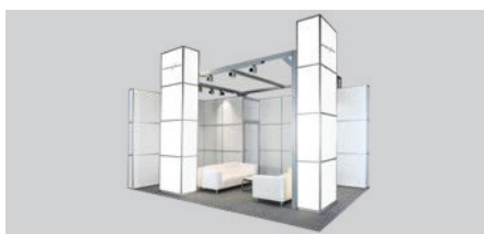
Complete rental stand SATURN

Complete price EUR 181.00/m 2 , minimum stand space 15 m 2