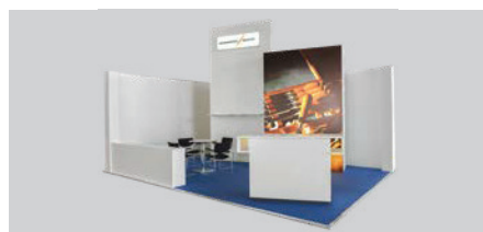
Complete rental stand SIRIUS

Complete price EUR 159.90/m 2 , minimum stand space 24 m 2