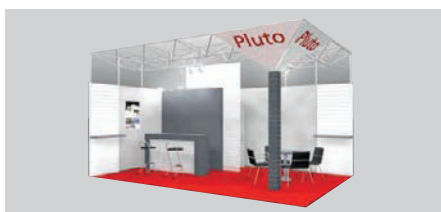
Complete rental stand PLUTO

Complete price EUR 152.90/m 2 , minimum stand space 15 m 2