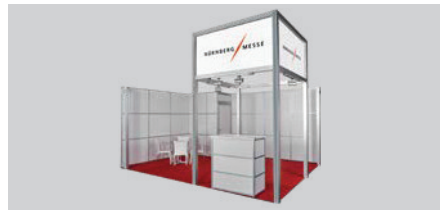
Complete rental stand CALYPSO

Complete price EUR 147.50/m 2 , minimum stand space 20 m 2