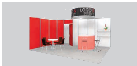
Complete rental stand OBERON

Complete price EUR 136.50/m 2 , minimum stand space 15 m 2