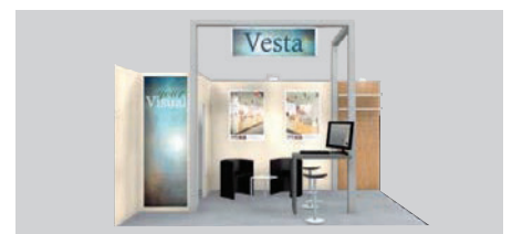
Complete rental stand VESTA

Complete price EUR 165.90/m 2 , minimum stand space 24 m 2