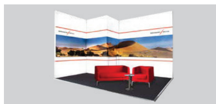
Complete rental stand SONNE

Complete price EUR 199.90/m 2 , minimum stand space 28 m 2