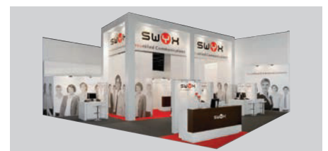
Individual stand design

Complete price EUR 292.50/m 2 , minimum stand space 24 m 2