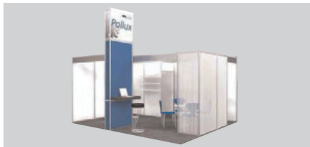
Complete rental stand POLLUX

Complete price EUR 147.50/m 2 , minimum stand space 20 m 2