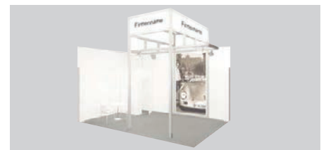
Complete rental stand APOLLO

Complete price EUR 136.50/m 2 , minimum stand space 15 m 2