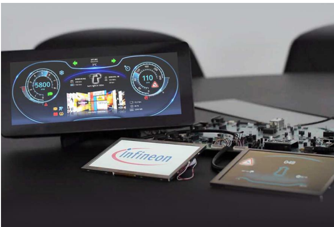
Image 2: Full virtual dashboard and dual Head-up display created with Candra CGI Studio on Infineon Traveo II

Candra is excited to announce that it has been recently accredited as first certified partner within Infineon's HMI Tool Certification Program. Infineon has designed this special evaluation program in order to ensure the best customer satisfaction and experience when using HMI software with the Infineon TRAVEO™ II Graphic Controller. At Embedded World 2021 Candra will show the certified HMI solution, a full digital instrument cluster and a warped dual Head-up display – both created with CGI Studio on Infineon TRAVEO™ II Graphic Controller.