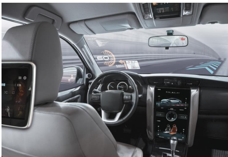
Image 4: Holistic HMIs enable a perfect interaction and communication between multiple displays

Holistic HMIs will not only have the ability to perfectly interact and communicate with each other, they will be able to connect with nomadic devices (e.g. Apple CarPlay, Google Android Auto) and consider both: the driver's situation as well as the traffic environment.