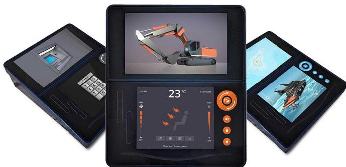
Image 3: Haptic User Interface created Candera, next system and DATA MODUL

Together with next system and DATA MODUL Candera has developed an innovative HMI solution, supporting intuitive touch feedback technology. Featuring different use cases in application fields like industry, nautics, medicine and many more, the solution also includes a haptic pin pad, that supports person with visual impairment. This new solution will be available at the virtual booth and presented during the speaker slot.