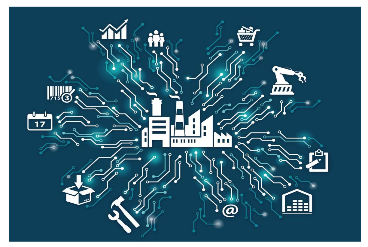
Bild 1 Digitalisation and intelligent components make our lives more comfortable and safer

The opportunities of digitalisation for the window and façade industry as well as the practical use of intelligent components will be shown at Fensterbau Frontale 2020 as part of the special show "Fenestration digital - digital processes, products, tests and services" in Hall 1.