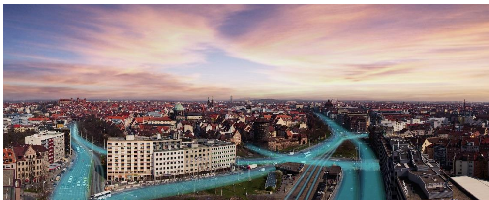
Nuremberg: Important place for digitalization.

Just a little older than her successors at Nuremberg University of Music, Ms Garifullina, incidentally, is active in the digital world as well. Her Instagram account alone has 1,323 posts and over 680,000 followers, and her videos have already had more than 30,000 views. She says public appearances are part of her job too – both in the real world and the digital world.